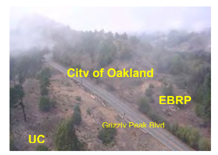
The Hills Emergency Forum facilitates a cooperative approach among eight governing organizations addressing urban wildland interface fire issues in the Oakland-Berkeley hills.