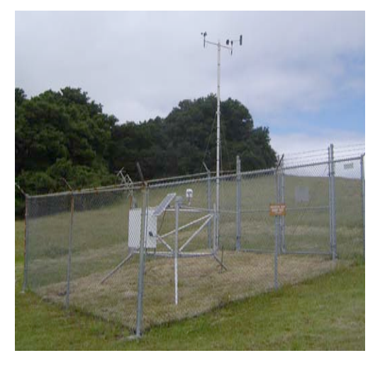
The Hills Emergency Forum facilitates a cooperative approach among nine governing organizations addressing urban wildland interface fire issues in the Oakland-Berkeley hills.